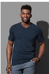
ST9610 Clive V-neck