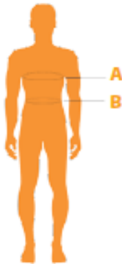
TABELLA CONVERSIONE TAGLIE / SIZE CONVERSION CHART